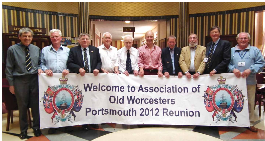
The Committee and friends showing off! June 2012.

A formal lunch was served in Boathouse 7, the restaurant in the Naval Dockyard, and this historic place proved of great interest for the many who had not been there before. Another reunion dinner had been enjoyed by many OW's on board HMS Warrior some years before.